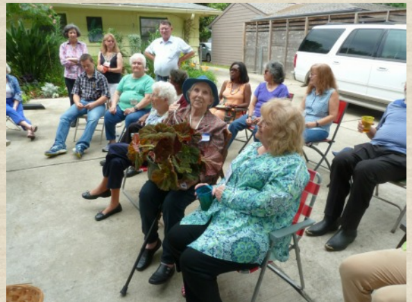
Members waiting for their numbers to be drawn.