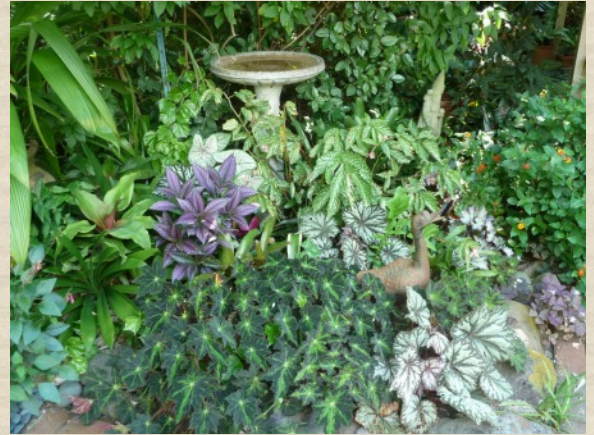
Begonias growing in garden along with bromeliads and Persian shield.