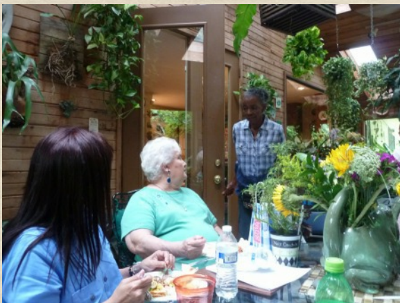
Members eating and relaxing in the garden room.