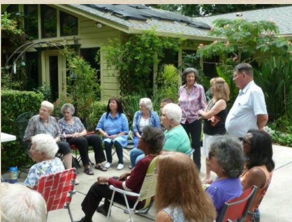
Members & guests assembled for our Business Meeting.