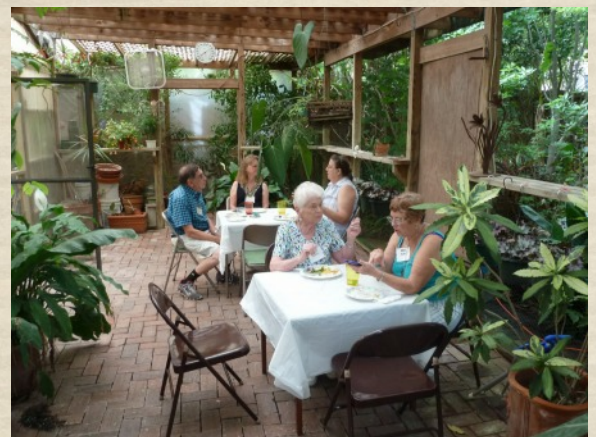
Quiet lunch in the big greenhouse.