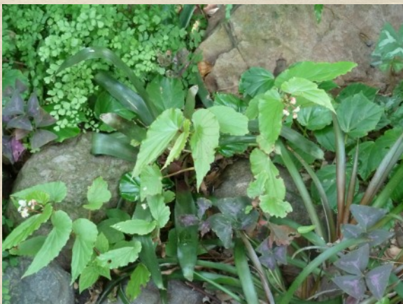
Vietnam species growing in garden unprotected for three years.